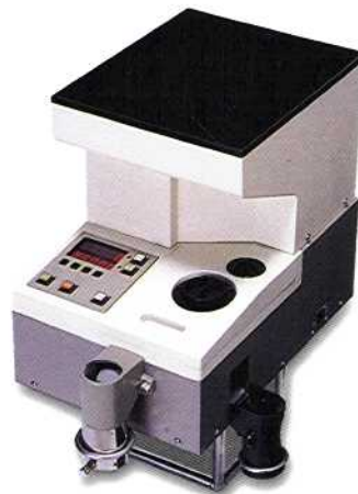
Magner Model 930