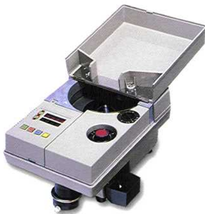
Magner Model 920